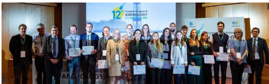
The recipients of travel grants, with the chairs of the POC and EAA executives

The ECA was also a great opportunity for informal networking, with a nice welcome reception and numerous breaks with good food and drinks. The social programme culminated with a festive congress dinner held at the Congress venue, animated by a lovely concert of Spanish songs presented by local musicians.