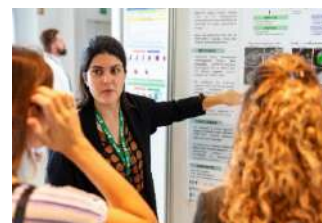
One of the poster sessions

Young scientists had a dedicated session organised by the Network of Young Researchers in Andrology (NYRA). Two well-attended poster sessions provided additional opportunities to young andrologists to showcase their projects. Numerous travel grants were issued by the EAA, the International Society of Andrology (ISA), ANDRONET COST Action and the Italian Society of Andrology & Sexual Medicine (SIAMS).