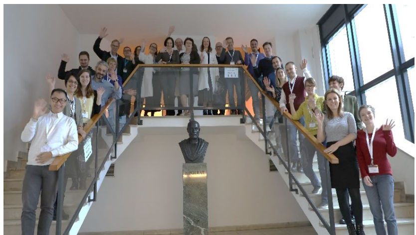
The attendees and faculty members of the EAA Winter School at the venue (Medical Faculty of Zagreb University).