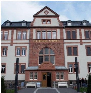
The historical venue of the Molecular Andrology Workshop and NYRA meeting in Giessen.

The scientific programme covered testis development, testicular organoids, sperm function and deficiencies, single cell transcriptomics, and genetic and immunological aspects of testicular and epididymal (dys)function.