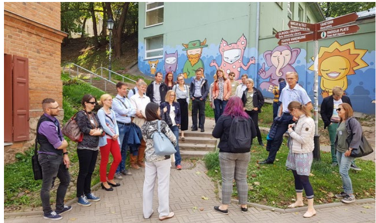
A group of participants enjoying a sightseeing walk around Tartu.