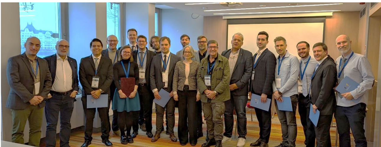
Newly certified Clinical Andrologists and the examiners at the Budapest School (8 March 2024)