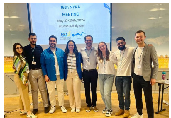
NYRA Board members at the Brussels meeting