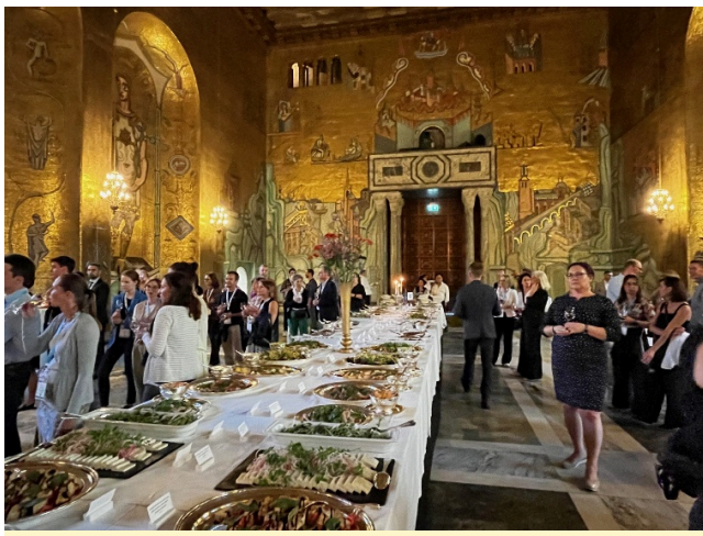
The Welcome Reception at the Stockholm City Hall.

The ECA was also a great opportunity for informal networking, with an excellent social programme.