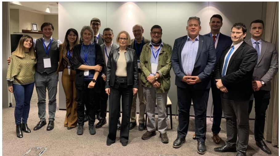
The newly certified clinical andrologists and the examiners in Budapest